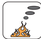
Low Corrosivity IEC60754-2/EN50267-2-2/3 NF C32-074/NF C20-453