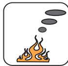
Low Toxicity EN 50305; NF X70-100/NF F63 808/TM1-04/BS 6853