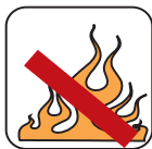
Flame Retardant NF C32-070-2.1(C2) IEC60332-1-2/EN50265-2-1