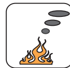
Low Smoke Emission IEC 61034-2 / EN 50268-2 NF C32-073/NF C 20-902